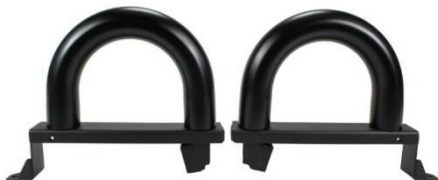
Black Bars Part No: WTP00B19