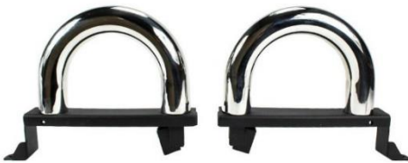
Chrom Bars Part No: WTP00B06